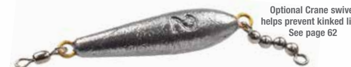
Optional Crane swivel helps prevent kinked lines See page 62