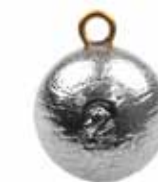
Round shape for a fast descent