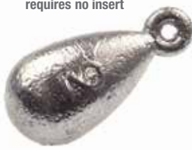
Molded eye requires no insert