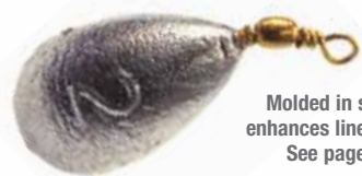
Molded in swivel enhances line control See page 62