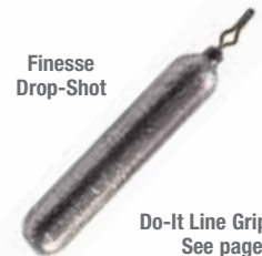
Do-It Line Grip Swivel See page 62