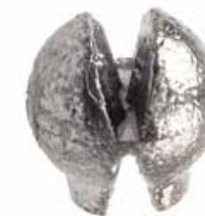
pinch the "ears" to remove