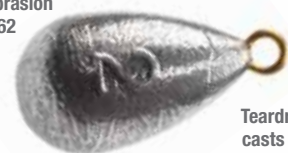
Teardrop shape casts smoothly