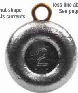
Donut shape resists currents Brass wire eye for less line abrasion See page 62