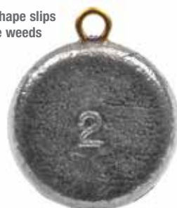
Round shape slips by the weeds