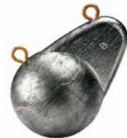
Special casting equipment. See page 87