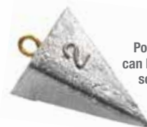
Pointed base can bury itself in soft terrain

The Pyramid Sinker excels in strong currents with any bottom condition. The pyramid tends to bury itself if the bottom is soft. On hard bottoms, the flat sides will prevent the pyramid from rolling with the current.