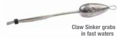
Claw Sinker grabs on in fast waters